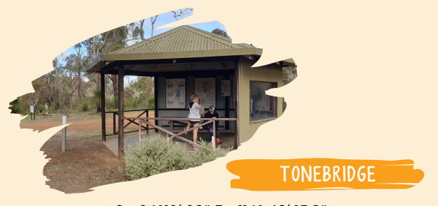
S - 34°13′ 39″ E - 116° 42′ 15.9″

Found along Jayes Road, which connects the Boyup Brook / Kojonup Road at Mayanup to the Boyup Brook / Bridgetown Road. The area at Jayes Bridge over the Blackwood River has ample room to park several caravans, a delightful picnic area with toilet, table and a cairn dedicated to the site of the Old Jayes Hall (the first public building in the district and the first non-private-home meeting place for the Upper Blackwood Roads Board). It is the site where the canoes finish, the swimming leg happens and the horses leave during the Blackwood Marathon (last weekend in October).