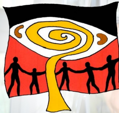
Noongar Boodjar Language Centre

This book which tells the story of the Blackwood River is available in our Centre. It is written in both Noongar and English and is accompanied by a CD spoken in Noongar which can be followed whilst reading the pages